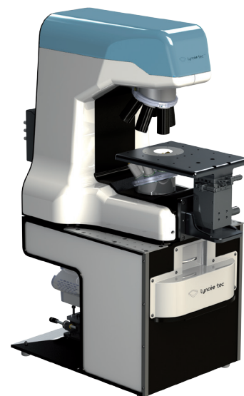
Transmission DHM® combined with a Fluorescence module