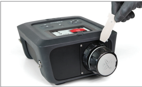
MX908 is equipped with modular accessories for ease of transition between solid, liquid, vapor, and aerosol sample types.