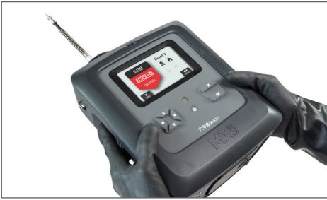
MX908 is rugged and meets the requirements for use in harsh environments.