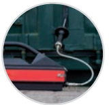
Container Port authorities